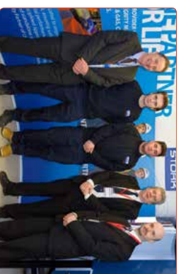
Stork apprentices and management with Southport College representatives

With technical advice and support from Stork engineers, the project was completed successfully and the furnace was installed early 2014.