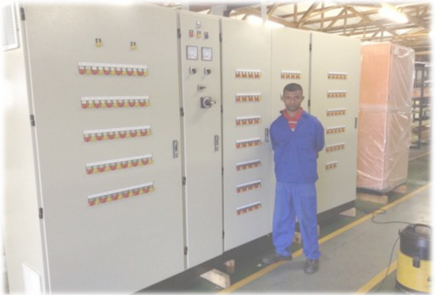
THS supplied Heat Trace Distribution Board No 1 of 2 – Lamson TLDD Project

THS utilize world class components in our Panels – “Moeller”, Eaton, Mitsubishi or to client preferred manufacture.