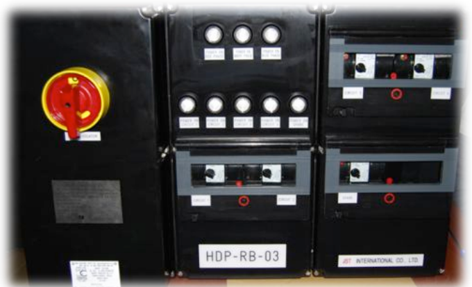
HL/HV JOC EXD Heat Trace Panels - Vietnam

Panels can be supplied in IP 41, 52, and any environment type up to EXd.